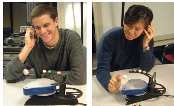
Figure 3. In conversation: the ball floats up and down in correspondence to the remote person's movement.